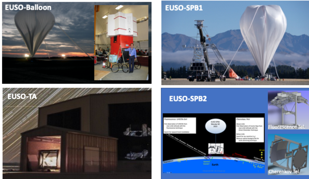
Figure 1: EUSO-TA and stratospheric balloon missions of the JEM-EUSO program. See text for details.