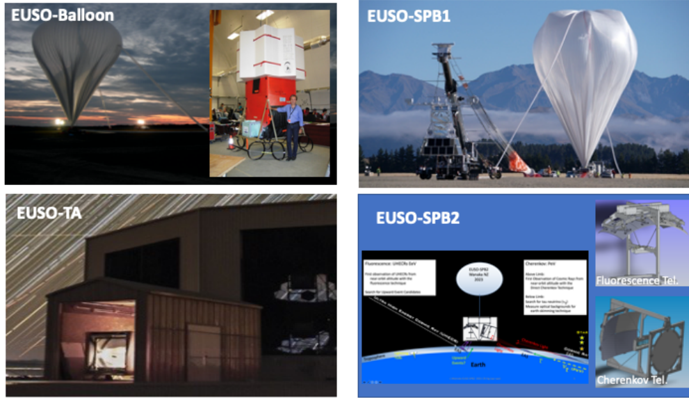
Figure 1: EUSO-TA and stratospheric balloon missions of the JEM-EUSO program. See text for details.