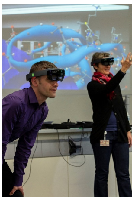
Figure 2. Use case for HoloLens 1. Livestream of the users' view (a stick and ball representation with an overlaid cartoon representation (peptide backbone) in the background).

HoloLens is a rather new technical development. It was introduced to the American and Canadian markets at the end of March 2016. HoloLens is a head-mounted display that is placed on the head like conventional glasses [22]. In the visual output of the device, artificial objects and information can be projected into the wearer's visual field, which can be interacted with via various gestures as shown in Figure 2.