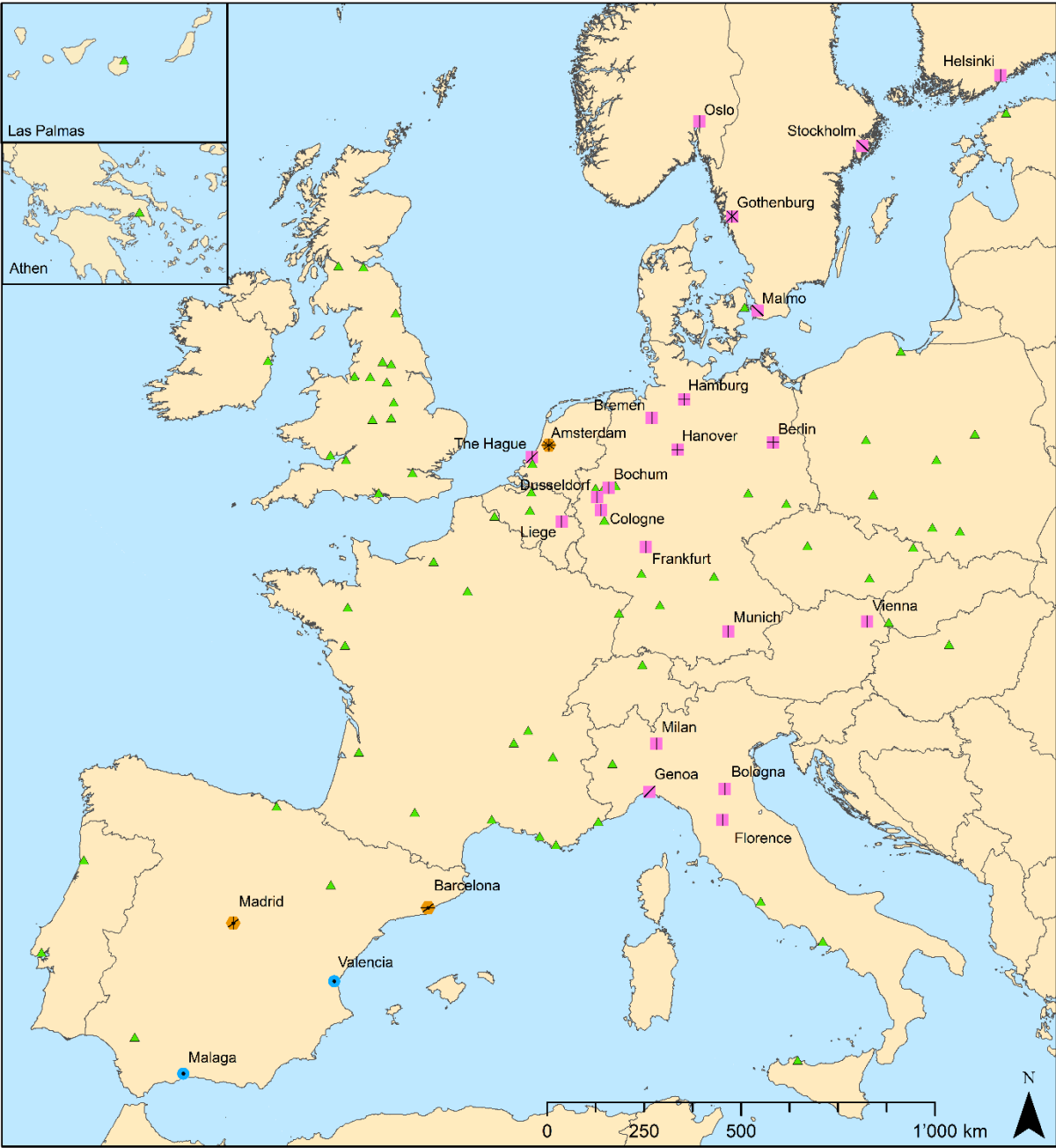
Figure 2. Map of Policies in Support of Irregular Migrants in European Cities