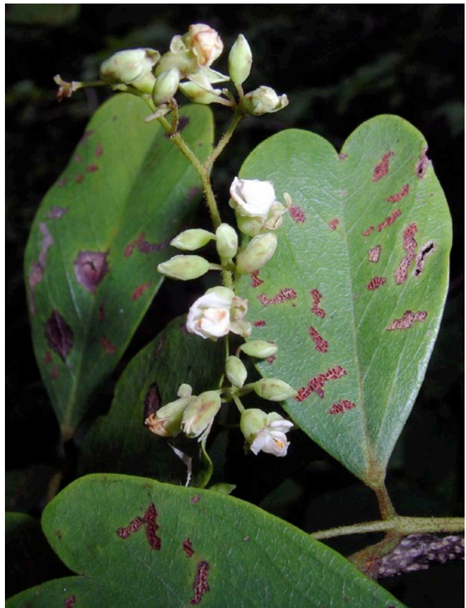
Fig. 6. – Dalbergia obcordata N. Wilding, Phillipson & Cramer. Inflorescence and leaflets. [Gautier et al. 4567]

Notes. – Phylogenomic and population genomic results (CRAMERI, 2020) support the recognition of Dalbergia obcordata as a distinct species and point to only a distant