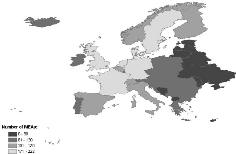
Fig. 3 Number of MEAs in 2006—Europe