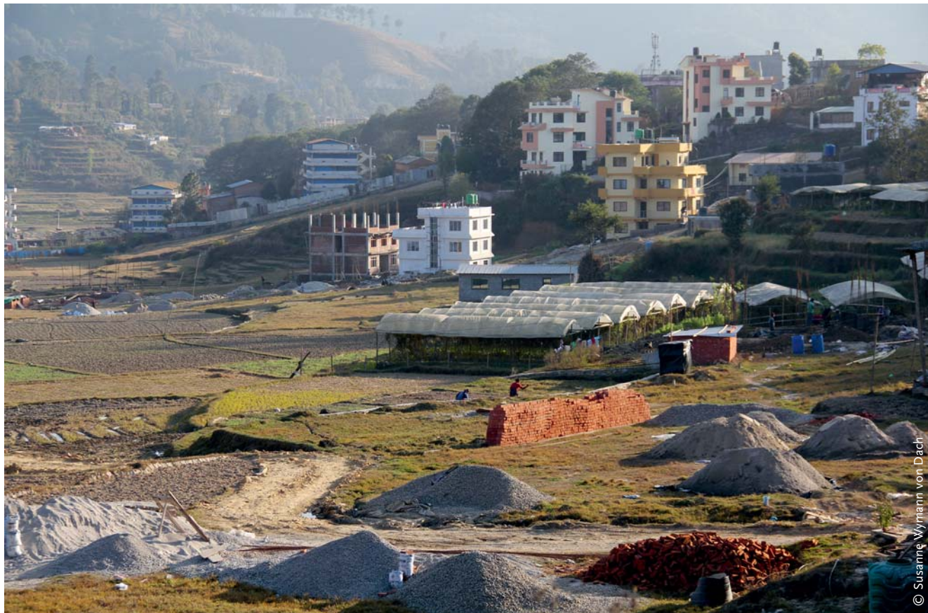
FIGURE 1: Brick-making for the vibrant construction sector is competing with efforts to intensify agriculture close to Dhulikhel, Nepal. Guiding efforts towards achieving the Sustainable Development Goals requires assessing not only benefits and trade-offs, but also assessing who gains and who loses at the local level.