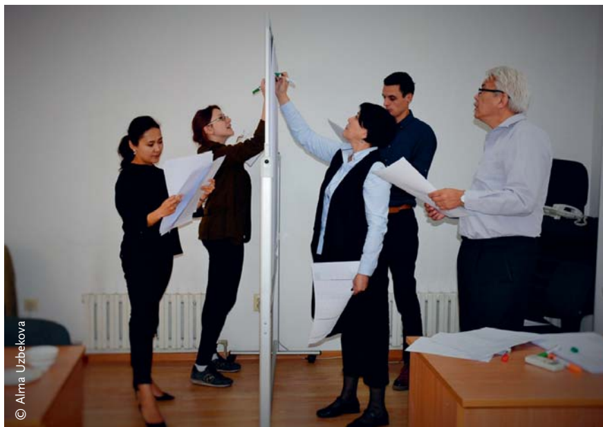
FIGURE 2: Experts in Kyrgyzstan assess the interactions between SDG targets that are of high priority and help to strengthen the resilience of mountain people and ecosystem in the Kyrgyz mountains.