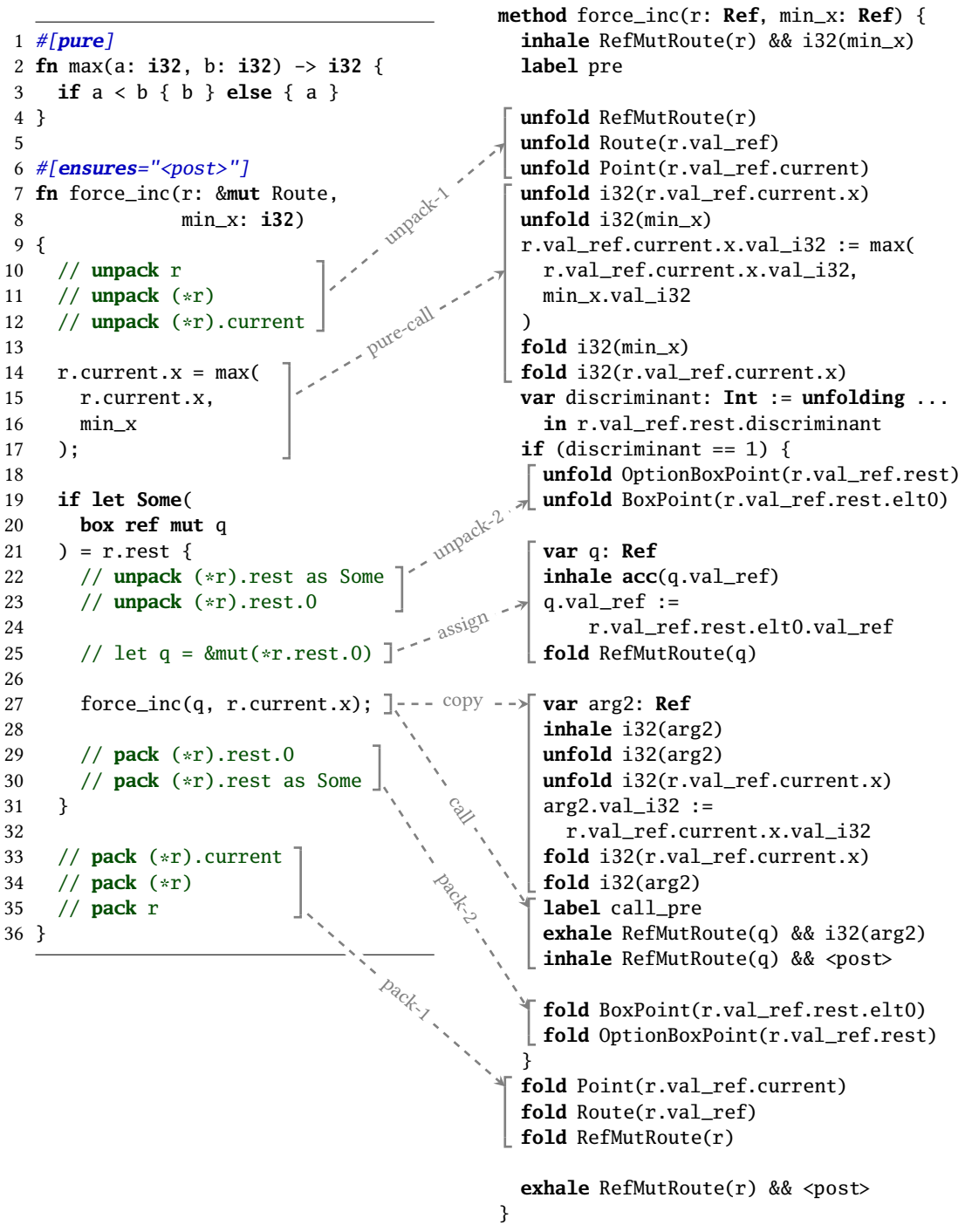
Fig. 7. An encoding of force_inc to Viper. The function is augmented with pack and unpack operations, and is then translated to the Viper method shown on the right. The encoding of the postcondition <post> is in Fig. 9. Note that Rust implicitly dereferences r when accessing its fields.