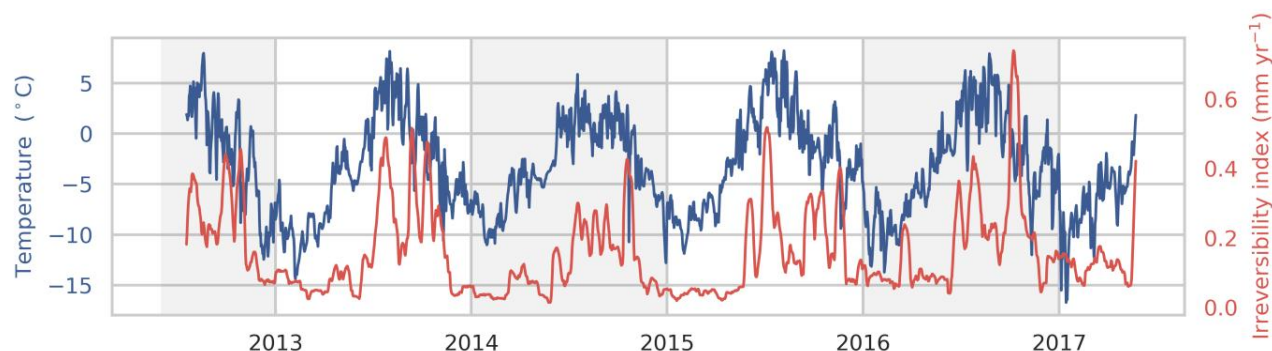
Figure 1: Irreversibility index for one of the crackmeters installed at the Piton Nord (South Face, Aiguille du Midi) and local air temperature (2012–2017)

(Weber et al. , 2017), that quantifies irreversibility within fracture kinematics.