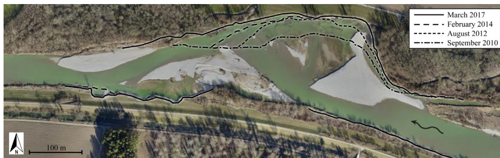
Figure 3. The lower part of the 1700 m long dynamic river widening Schaffäuli along the Thur River in 2016. The channel of 50 m width was initially widened in 2003 and has eroded 26000 m 2 land until 2015.

Lateral mobility depends on active bank erosion [38]. Fig. 3 shows the temporal evolution of a dynamic river widening in Switzerland where active bank erosion was observed and large, mostly unvegetated bars have formed. Since infrastructure and property have to be protected, the planning practice in Switzerland comprises the definition of both an observation line and an intervention line [39]. When bank erosion reaches the observation line, the topographic monitoring is intensified, and possible protection measures are planned. The intervention line marks the outermost boundary of the river widening and has to be defended by bank protection structures like groins or riprap.