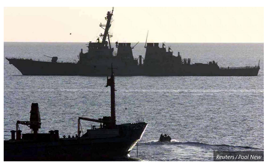
Complex enforcement of sanctions regime: Inspecting a freighter in the Persian Gulf, 2003

Since the end of the Cold War, economic sanctions have been imposed more often than ever before. At the same time, there are doubts as to their effectiveness. The fact is that apart from economic sanctions, there are few options between words and warfare to induce a change of behaviour in international actors. Therefore, sanctions will remain an important element of the foreign and security policy toolbox of the community of states. Consequently, the debate over when the imposition of economic measures is useful, and how such sanctions regimes should be designed, is gaining importance.