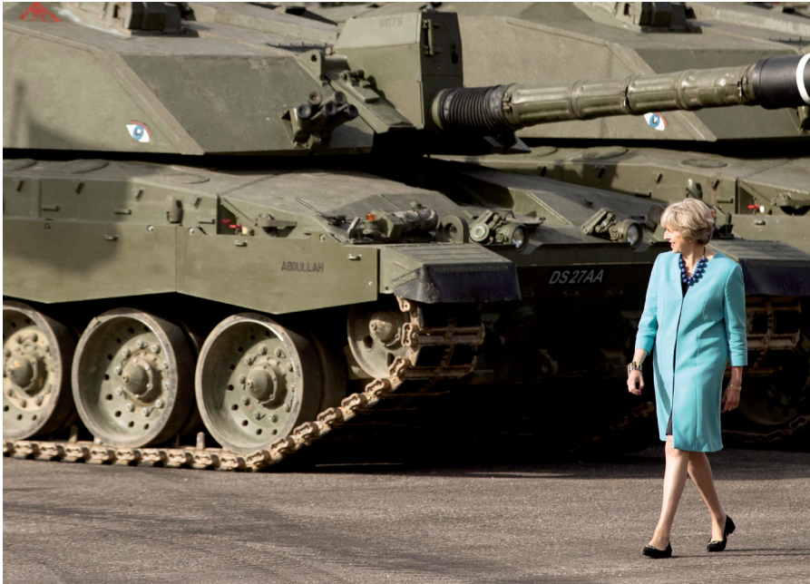
British Prime Minister Theresa May passes tanks at Bulford Camp on 29 September 2016 near Salisbury, England.

The British exit from the EU is feeding into a general sense of uncertainty about the EU's future. This uncertainty may be further exacerbated by US President Donald Trump, who has called into question both NATO's and the EU's viability. But irrespective of Brexit or the Trump administration's actions, it is vital that France, Germany, and the UK continue to work closely together on European defense post-Brexit.