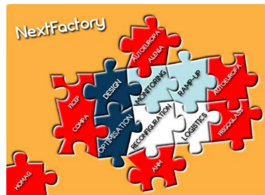
Fig. 3. VFF scenarios [1]

The need of verifying the impact of the VFF approach on the Real Factory asks for the cooperation of industrial partners to define demonstration scenarios that aim at testing and validating the proposed framework. Within the project, four demonstration scenarios (Figure 3) have been formulated by pairing different factory planning processes and industrial sectors.