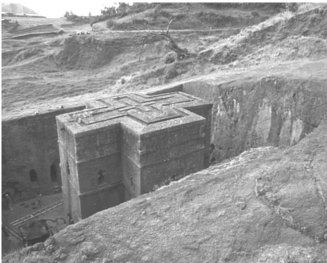
Fig. 1: Bet Giorgis rock-hewn church, Lalibela.

The town of Lalibela lies in the province of Wollo in northern Ethiopia, some 640 km from Addis Ababa. Lalibela is internationally renowned for its rock-hewn churches. Their creation is ascribed to King Lalibela, one of the last kings of the Zagwe dynasty. All 12 churches in the town are thought to have been constructed within a 100-year period around 1200 AD. Of the three basic types of rock-churches in Ethiopia, built-up cave churches, rock-hewn cave churches and rock-hewn monolithic churches, the last, which is of current interest, is unique to the Lalibela region. Arguably the most significant of Lalibela's four strictly monolithic rock-hewn churches is Bet Giorgis (the Church of Saint George), which is regarded as being the most elegant and refined in its architecture and stonemasonry. Fig. 1 shows the 12 x 12 x 13m Bet Giorgis standing within its 25m square trench.