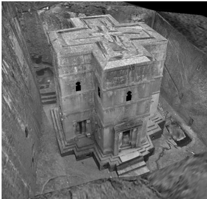
Fig. 7: 3D texture model generated with Disp3D .

If an object face is not visible on any image it cannot be mapped. In the case of the Bet Giorgis model this happened only for minor faces at the inner corners of the cruciform building. Here texture from similar, better visible elements was taken. Very oblique images also cause problems, as the texture information for a particular face is strongly smeared when rectified. Here mainly the top of the church is affected as no suitable high image viewpoints were available.