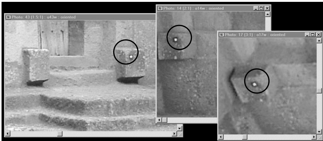
Fig. 5: The circles mark an exemplary indistinct corner of a door beam beside one of the artificial targets.

First measurements revealed one characteristic common to such ancient stone buildings. Most formerly sharp corners and edges were rounded or even broken off due to erosion processes. As a consequence it was often impossible to properly define homologous points in the respective images. The weathered corners of cornices in the foreground of Fig. 2 and the abraded corners of door beams in Fig. 5 serve as an illustration of this characteristic. This is a minor problem for points which are visible in several optimally arranged