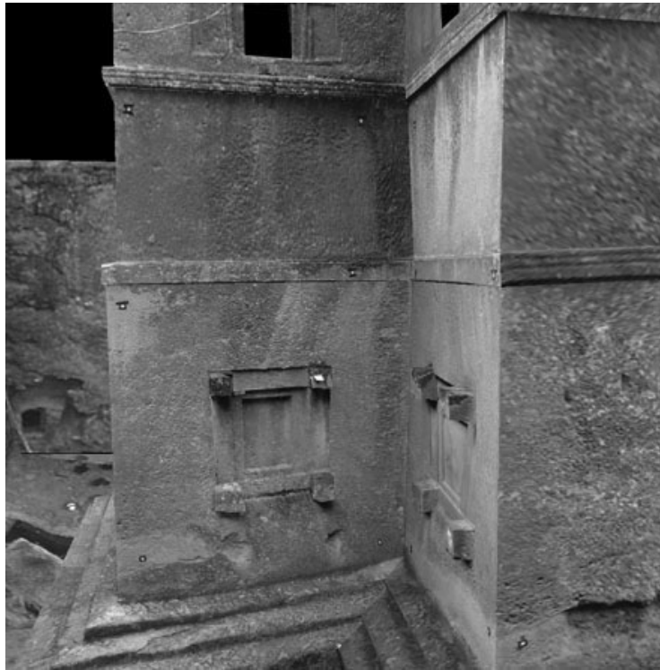
Fig. 8: Portion of 3D texture model (available in colour).

Disp3D delivers the following visualisation functions: point cloud; wireframe with hidden lines; shaded surface; and texture map in mono and stereo display, via anaglyph projection and polarized stereo. Image streams for MPEG-1/MPEG-2 videos can also be created. The final textured model can be viewed with Disp3D or it can be converted to VRML2 for viewing with standard visualization packages. Our model will also be made available on the Web at a later date.