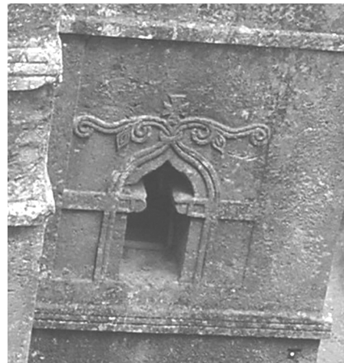
Fig. 2: Ornaments at upper windows and weathered corners of cornices in the foreground