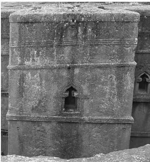
Fig. 6: Parallelism cannot be assumed.

images. A slightly different definition in one or another image does not carry weight as the bundle adjustment process leads to an acceptable accuracy in the cm-range. But in cases where a point cannot be properly defined, and in addition is visible only on a few unfavourable images, an unacceptable error can result for this particular point. If such a point is part of a small structure, like the projecting corner beams in the doors and lower windows, the error becomes very evident in the visualisation product.