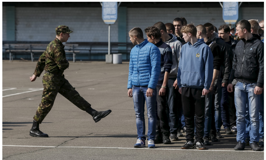
Conscripts entering the army: Nowadays happening only in 17 European countries.

In Western Europe, too conscription has once again become an issue; however, the context is a different one and is marked by societal issues. In France, for example, following the attack on the editorial offices of satire magazine "Charlie Hebdo" in January 2015, some commentators lamented the loss of the service national , which was ended in 2002, and its integrative and didactic function. Due to this perspective, the debate took a different direction than those in Eastern Europe or Scandinavia: A number of notable politicians proposed a general community service for women and